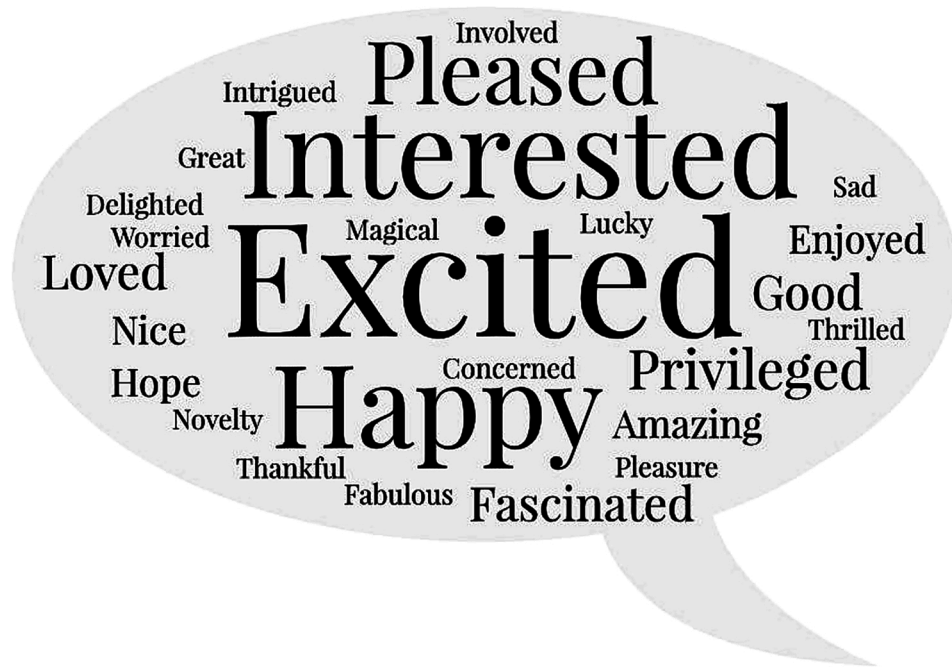
Fig. 2. Overview of word frequency analysis of emotion words (including stemmed words) used by respondents to the mail-return questionnaire to indicate how they felt upon seeing beavers or signs of their activity.

including the main business types in the village. We propose therefore that the beaver-watching riverbank users provided some economic benefit for local businesses. This finding is similar to that reported by the Scottish Beaver Trial that local tourist and retail operators were generally favourable of the tourism-related value of the trial (Moran & Lewis, 2014).